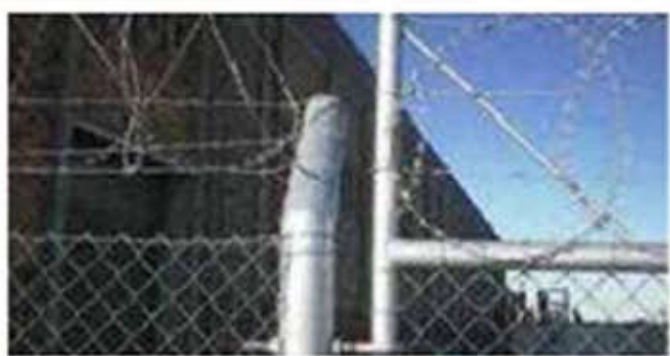
Bezinal Mesh Fence