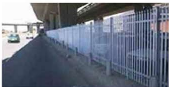
Angle Iron Palisade